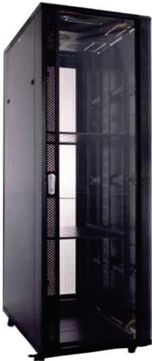
Reference image only